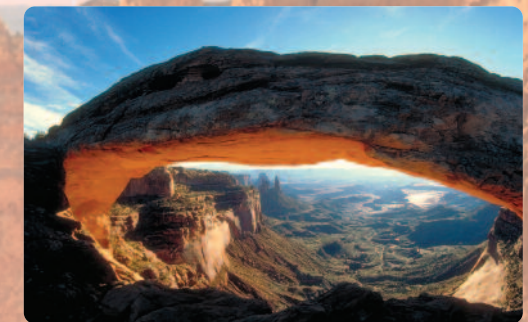
Mesa Arch, Canyonlands

Day 10 > Drive only 11 miles today to drop off your Motor Home back at Cruise America.