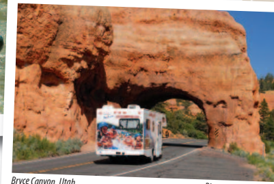
Bryce Canyon, Utah