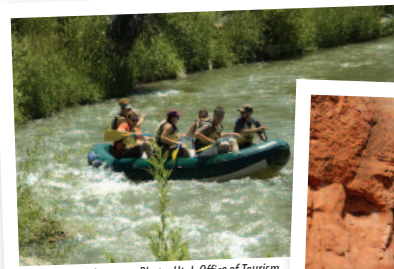
White water rafting

Day 6 > Bryce Canyon National Park has been described as a scientist's laboratory and a child's playground. It certainly is 'one of a kind' and spectacularly different from anything you have seen before. Natural amphitheatres lie above an array of white and orange limestone columns and walls sculptured by rain, snow, and frost. You are (currently) permitted to drive in the park but it is strongly recommended that you use the free shuttle that serves twelve stops,