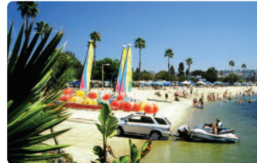
Campland on the Bay

Day 5 > Return to Yosemite and, this time drive right through Yosemite to join the very scenic Route 395 headed south on the other side. There's so much of importance linked by this road that it has its own website – 395.com. Having just left Yosemite, you'll now pass between no less than three more National Parks: Kings Canyon, Death Valley and Sequoia. You'll also pass Mt. Whitney, the highest point in the contiguous USA. It's almost within sight of the lowest point which is in Death Valley's Badwater Basin. 256 miles to Lone Pine