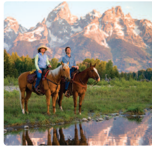
Horse riding in Grand Teton