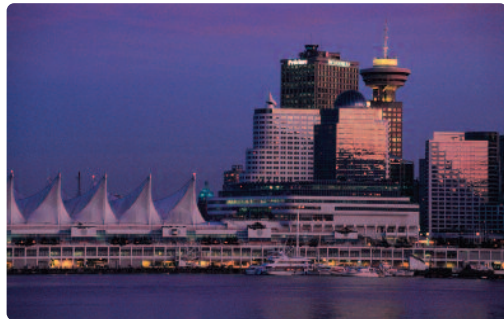
Coal Harbour, Vancouver

Day 2 > A long but very worthwhile drive will take about 4 ½ hours as you head first along the Transcanada Highway and then turn near the town of Hope for the Okanagan Valley. The scenery of the Valley is out of this world. This area also provides the opportunity to visit many of the Valley's vineyards in Oliver, Penticton, Okanagan Falls, Kelowna... and more. See www.kelownagolfski.com/okanaganwineries.htm