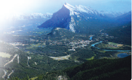
Aerial view of Banff

Day 8 > Just fifteen miles back to the Cruise Canada rental location to return your motorhome.